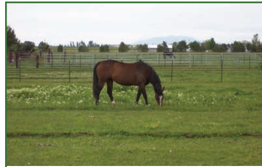
Livestock grazing on noxious weeds is a major vector for weed propagation.

To have your forage or straw crops inspected, first schedule an inspection with Ada County Noxious Weed Control. Our crews must inspect the commodity before you harvest it to make a determination regarding its certification. There is an inspection fee based on the number of acres you wish to have inspected. If your commodity passes, we will order bale twine or bale tags from the ISDA on your behalf so your products may be identified as having passed the inspection. An additional fee for the bale twine or bale tags will be applied to the total due to Ada County.