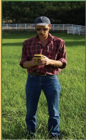
GPS data are collected during inspections.

In order to limit the spread of noxious weeds on federal forest and public lands, Ada County works together with the Idaho State Department of Agriculture's (ISDA) Noxious Weed Free Forage and Straw program to inspect forages and straw.