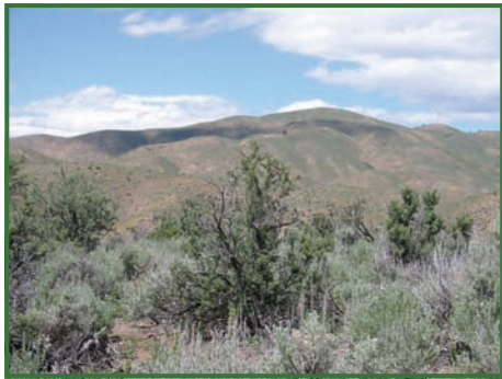
Noxious Weed Free Forage ensures healthy ecosystems.

Ada County can inspect and certify your crops as Noxious Weed Free for a small fee to cover labor and supplies. Our interest is in serving the citizens of Ada County and in keeping Ada County a better place to live, work and play.